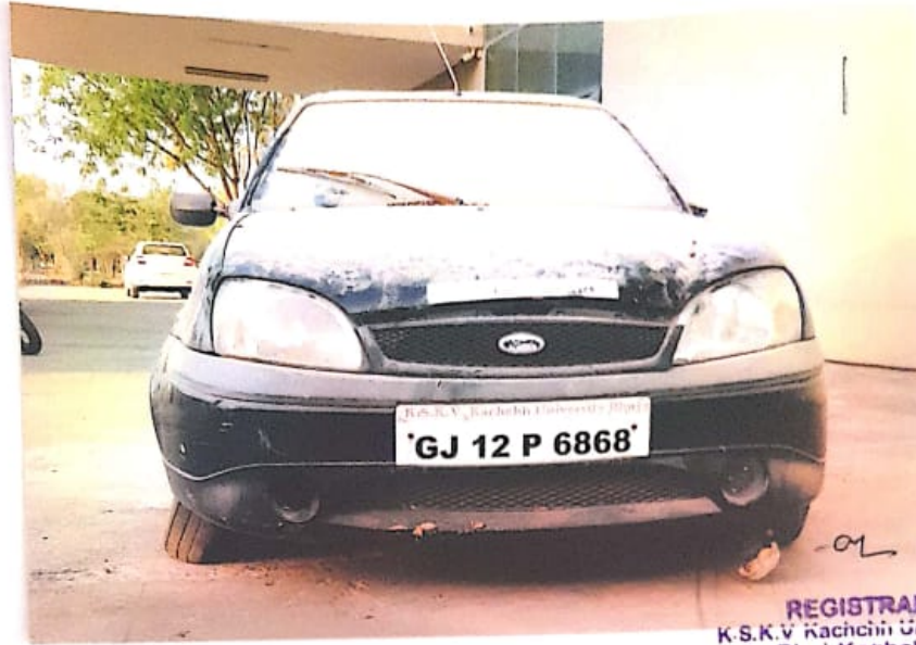
FORD ICON (GJ 12 P 6868) આગળ ની બાજુનો કલર ફોટો નંબર પ્લેટ સાથે. (front colour photo)

REGISTRAR K.S.K.V Kachchh University Bhuj-Kachchh