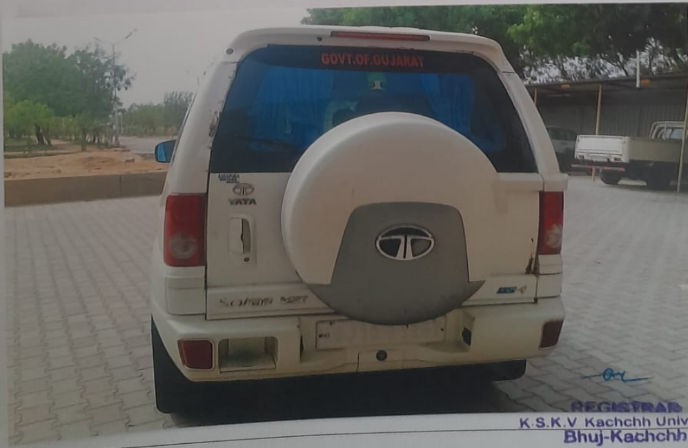
પાછળ ની બાજુનો કલર ફોટો નંબર પ્લેટ સાથે. (back colour photo)

REGISTRAR K.S.K.V Kachchh University Bhuj-Kachchh