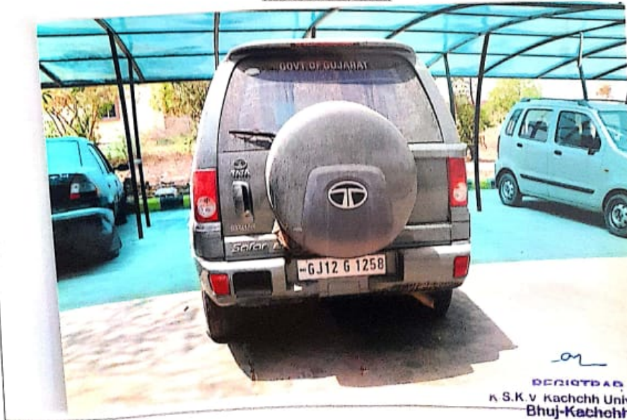
પાછળ ની બાજુનો કલર ફોટો નંબર પ્લેટ સાથે. (back colour photo)

an REGISTRAR K.S.K.V Kachchh University Bhuj-Kachchh