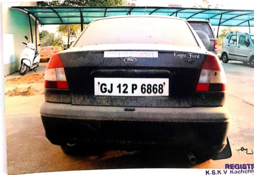
પાછળ ની બાજુનો કલર ફોટો નંબર પ્લેટ સાથે. (back colour photo)

REGISTRAR K.S.K.V Kachchh University Bhuj-Kachchh