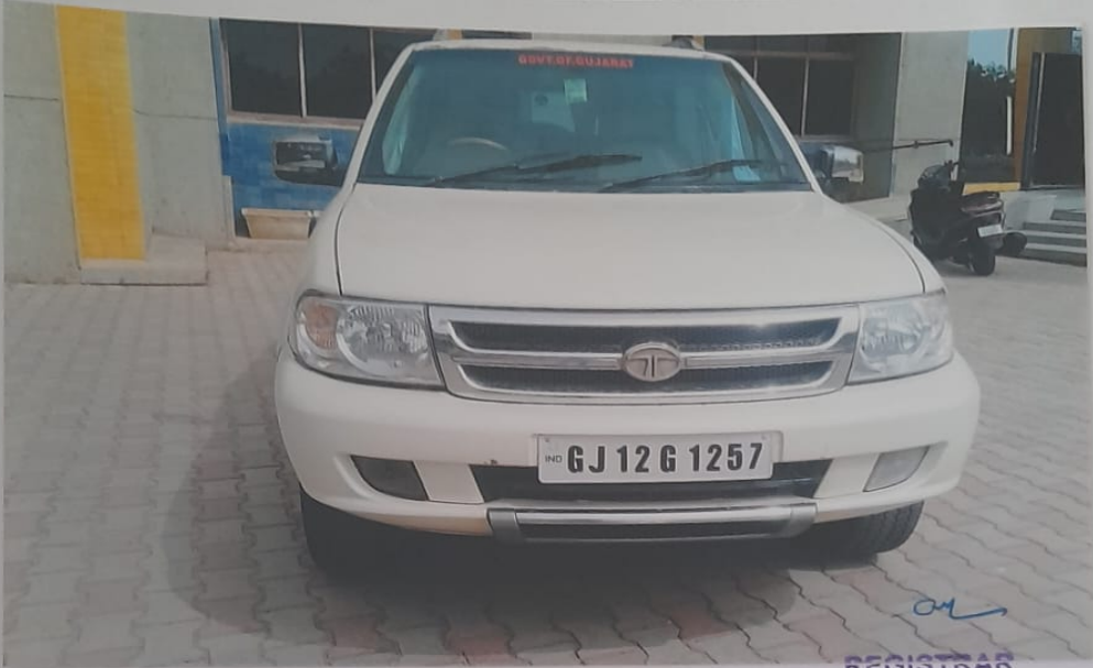
TATA MOTORS GJ 12G 1257 આગળ ની બાજુનો કલર ફોટો નંબર પ્લેટ સાથે. (front colour photo)

REGISTRAR K.S.K.V Kachchh University Bhuj-Kachchh