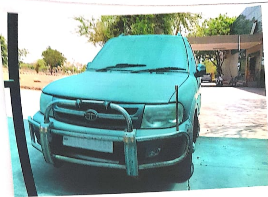
TATA SAFARI (GJ 12 G 1258) આગળ ની બાજુનો કલર ફોટો નંબર પ્લેટ સાથે. (front colour photo)

an REGISTRAR K.S.K.V Kachchh University Bhuj-Kachchh