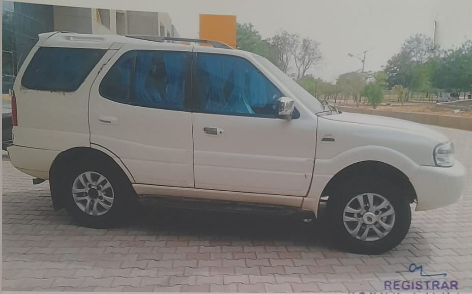
TATA MOTORS GJ 12G 1257 જમણી બાજુનો કલર ફોટો. (right side colour photo)

REGISTRAR K.S.K.V Kachchh University Bhuj-Kachchh