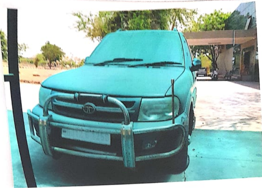
TATA SAFARI (GJ 12 G 1258) આગળ ની બાજુનો કલર ફોટો નંબર પ્લેટ સાથે. (front colour photo)

an REGISTRAR K.S.K.V Kachchh University Bhuj-Kachchh