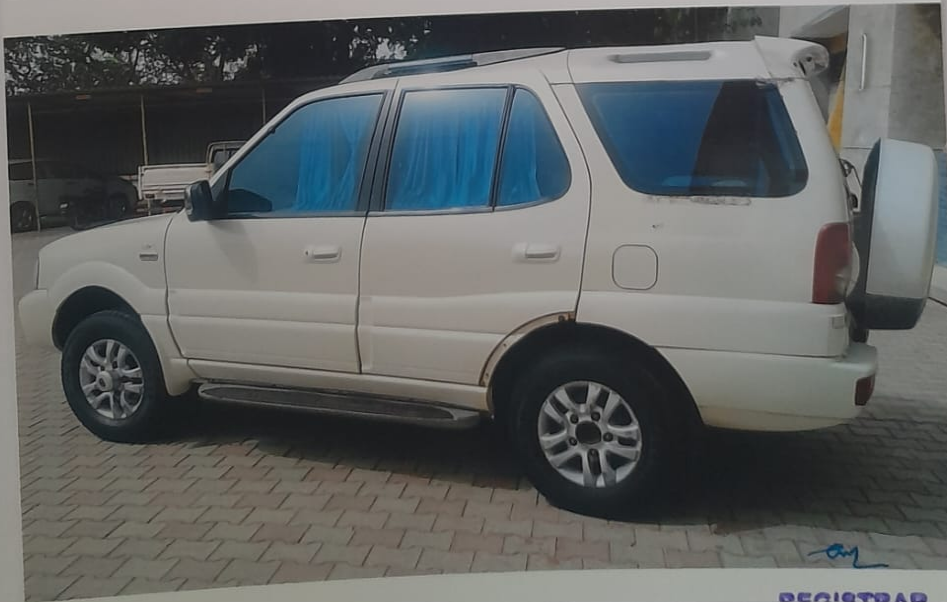
ડાબી બાજુનો કલર ફોટો. (left side colour photo)

REGISTRAR K.S.K.V Kachchh University Bhuj-Kachchh